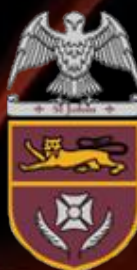
St John's C of E Primary School

We also have three grass routes Football Clubs from our Bees Affiliates Programme in attendance today: